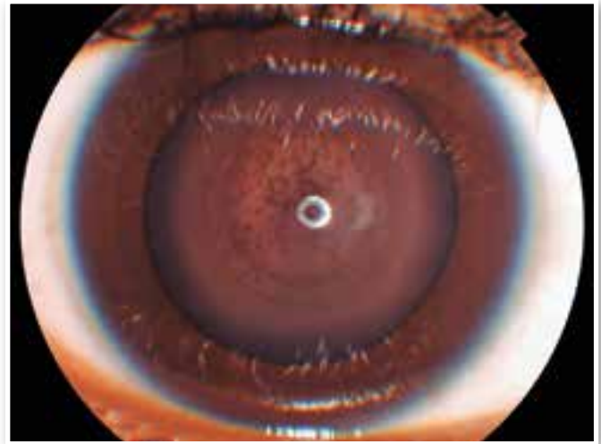
Figure 1. Anterior segment biomicroscopy showing bluish-white opacities in the lens region.

1. Stival LRS, Bittar RHG, Lago AM, Nassaralla Junior JJ. Catarata em árvore de Natal. Rev Bras Oftalmol . 2015;74(5):309-11.