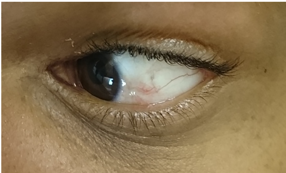
Figure 2. Photograph taken two years post-operatively, with no signs of relapse

To date, at two years of follow-up, the patient did not present lesion recurrence or systemic manifestations (Fig. 2).