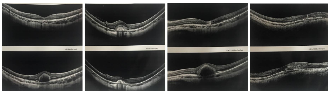
Figure 2. SD-OCT showing myopic CNVMs before and after treatment in different cases. Images below: pretreatment; above: posttreatment.

Regarding visual outcome, two eyes remained stable (no vision improvement: 7.14%), 4 eyes have won three lines of Snellen (14.28%), and 22 eyes had improved vision in four or more lines (78.58%). No difference was observed between ranibizumab and bevacizumab in terms of visual outcome on the Snellen chart.